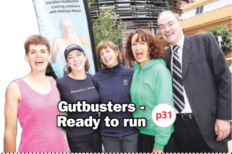
Gutbusters - Ready to run p31