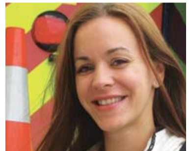
Round the Bays see p15

Photo: Kate Bleasdale / NW dragon boats01 090210