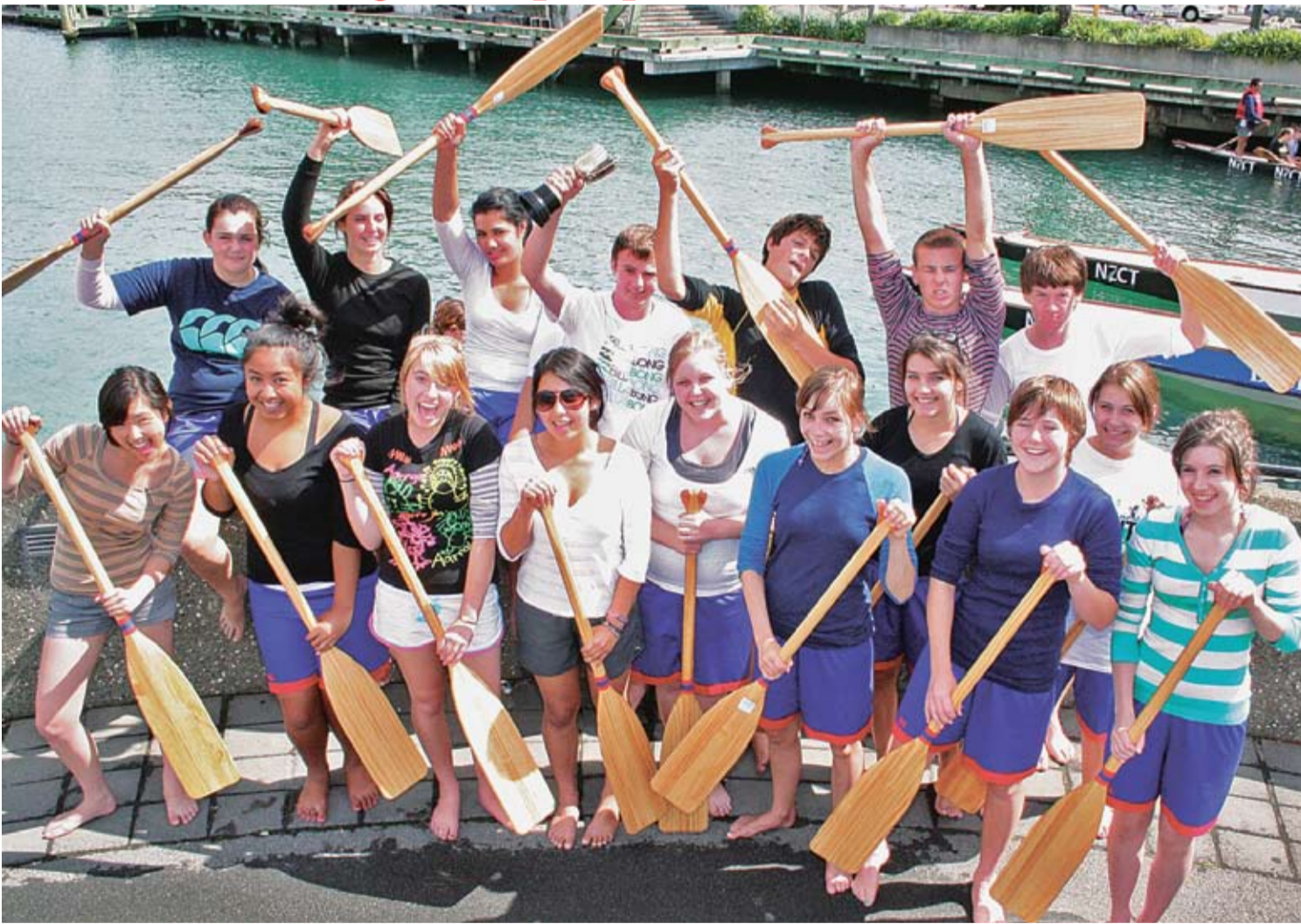
BRING IT ON: Reigning Wellington Dragon Boat Festival mixed teams 2009 champions Newlands College are already in training for the February 28 event in the Wellington Harbour. Running over two days of the weekend, this event is yet another popular occurrence in the fit-to-burst Wellington events calendar. The mixed team beat the WaiCol Eels by just 0.7 seconds last year in the grand final, and, as always, are hoping to place higher than long-time rival college Onslow. Corporate teams race on the Saturday while Sunday is left for college teams. Action runs from 9am-5pm each day and a good vantage point is along the Frank Kitts Promenade.